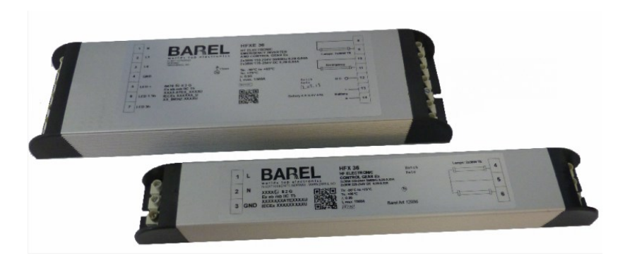
Special conditions for HFXE operation from DC-input must be considered. Contact Barel for further assistance