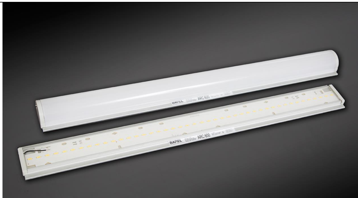
Diffused version (with cover): Part number with diffuser – add suffix «D», example: 11964D is with diffuser